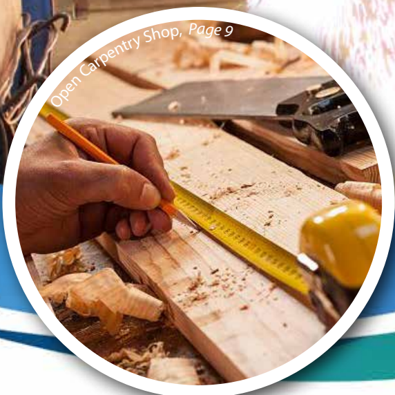
Open Carpentry Shop, Page 9