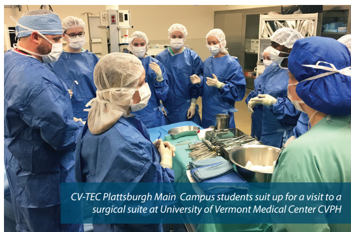
CV-TEC Plattsburgh Main Campus students suit up for a visit to a surgical suite at University of Vermont Medical Center CVPH

The New Visions: Medical Careers Program is an academically rigorous one-year exploratory program for selected college-bound seniors planning to major in a field of study such as pre-med, chemistry, biology or other allied health fields. The academic curriculum is combined with practical, applied work experience as students observe health care professionals at one of the area's medical facilities. Learn what the health care field is really about by working alongside professionals and their patients.