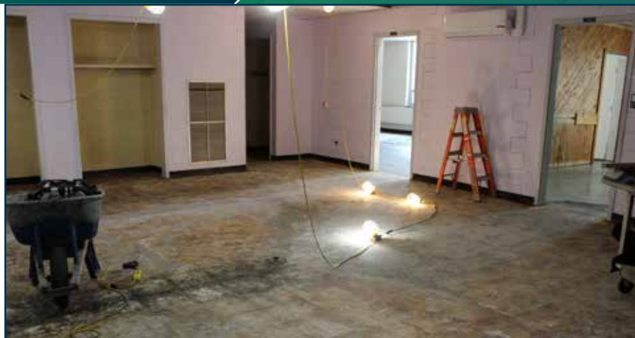
Demolition & renovation of Mineville's Main Office area JULY 2021