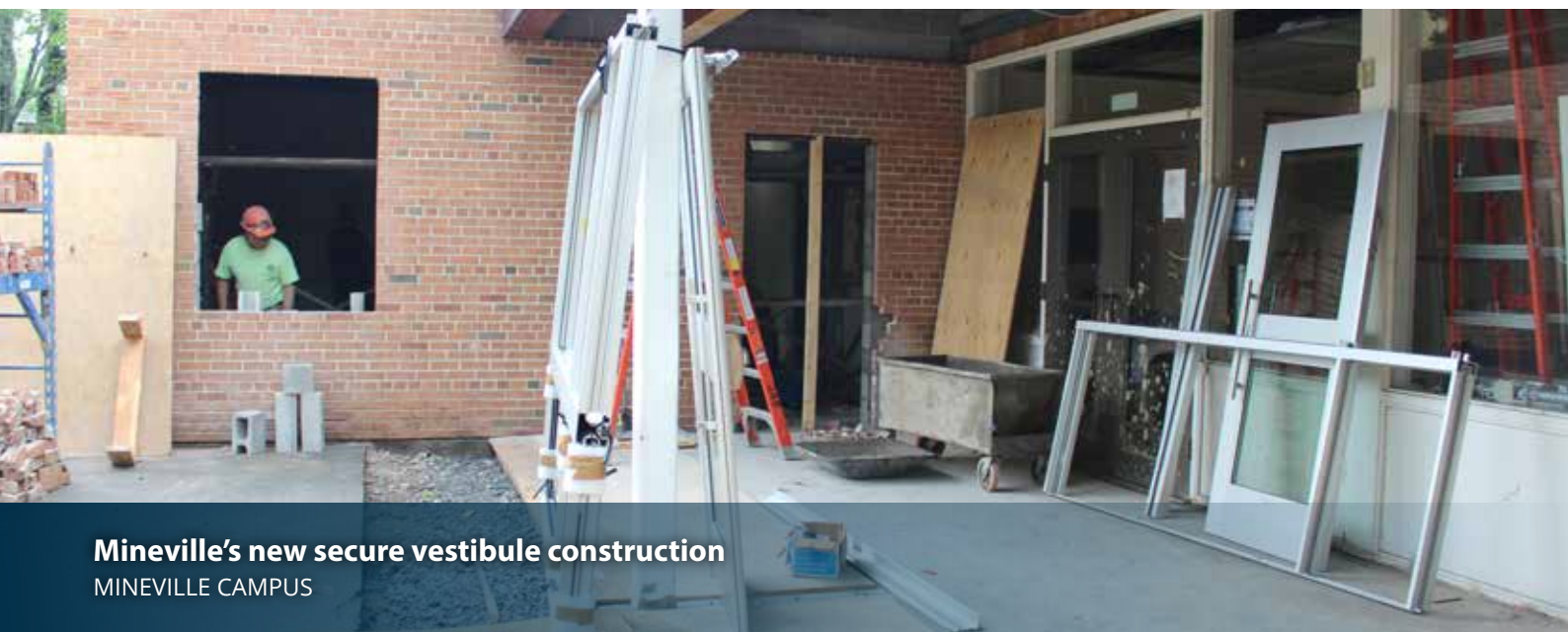
Mineville's new secure vestibule construction MINEVILLE CAMPUS

Champlain Valley Educational Services Capital Project Update - Issue #25 Monday, August 16, 2021