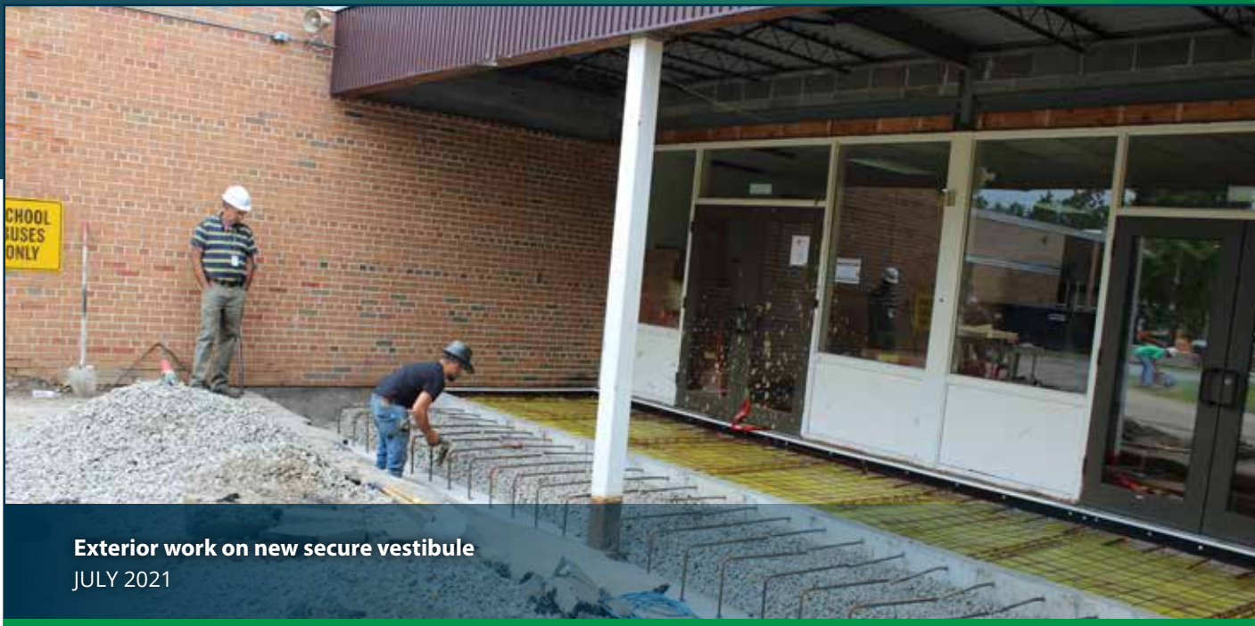
Exterior work on new secure vestibule JULY 2021