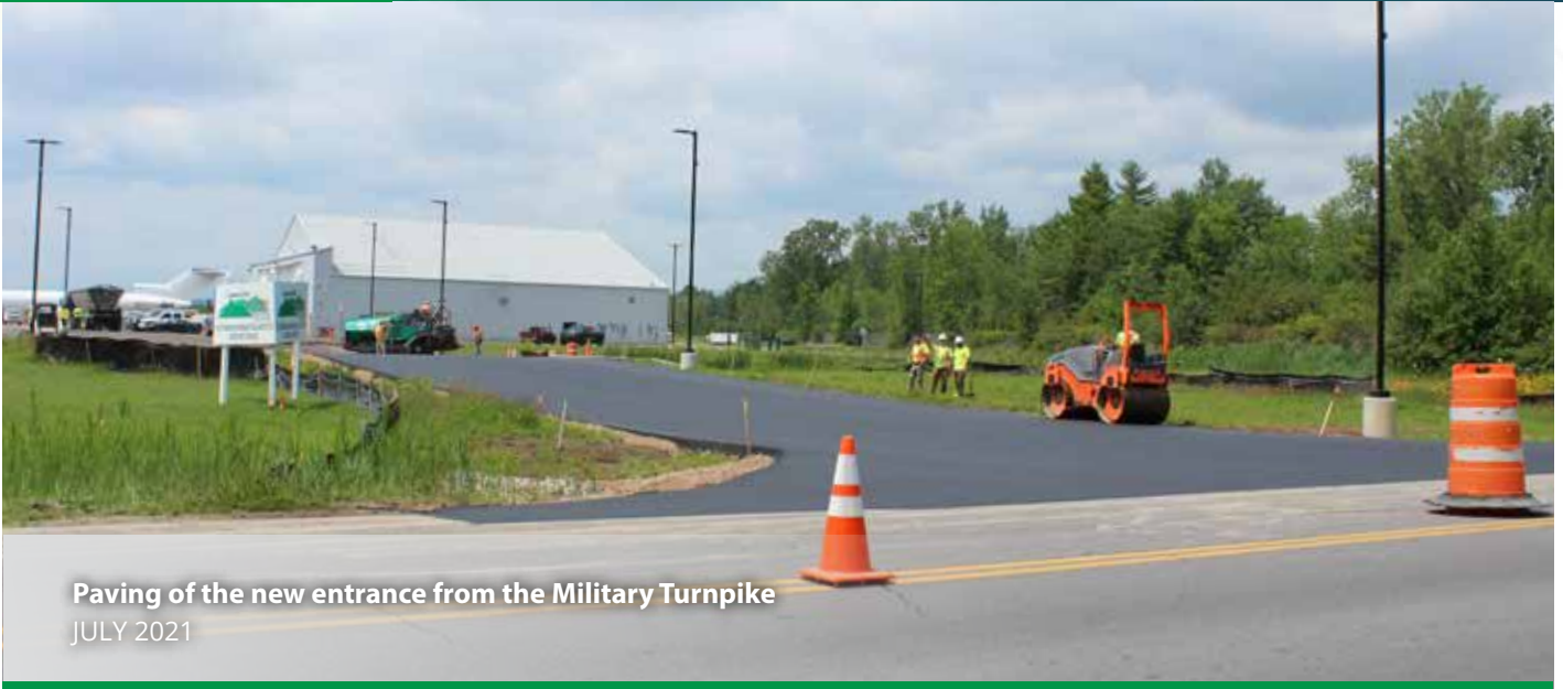
Paving of the new entrance from the Military Turnpike JULY 2021