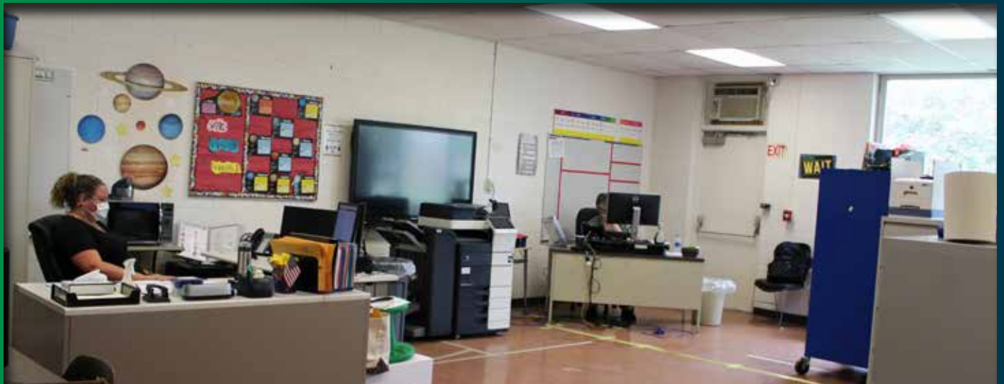
Mineville's temporary main office space during summer school JULY 2021