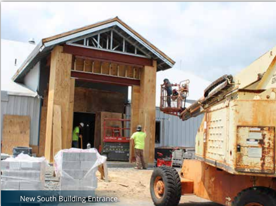
New South Building Entrance