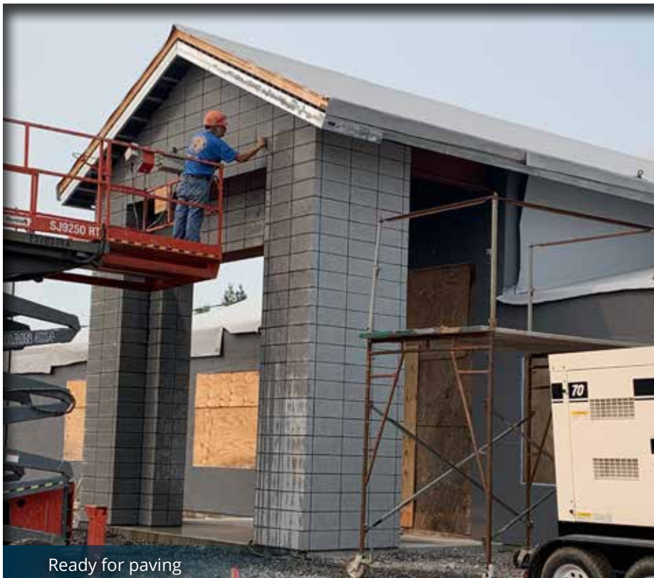
Ready for paving