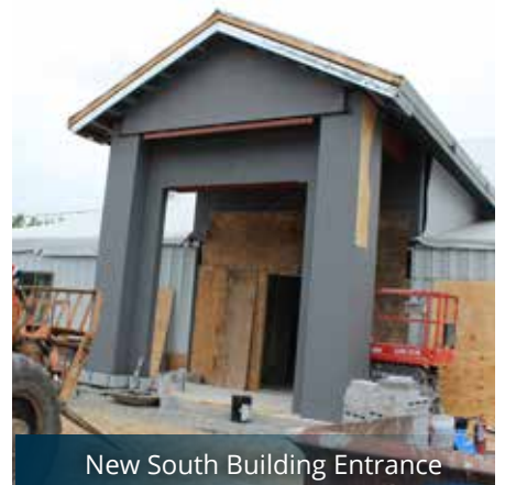
New South Building Entrance