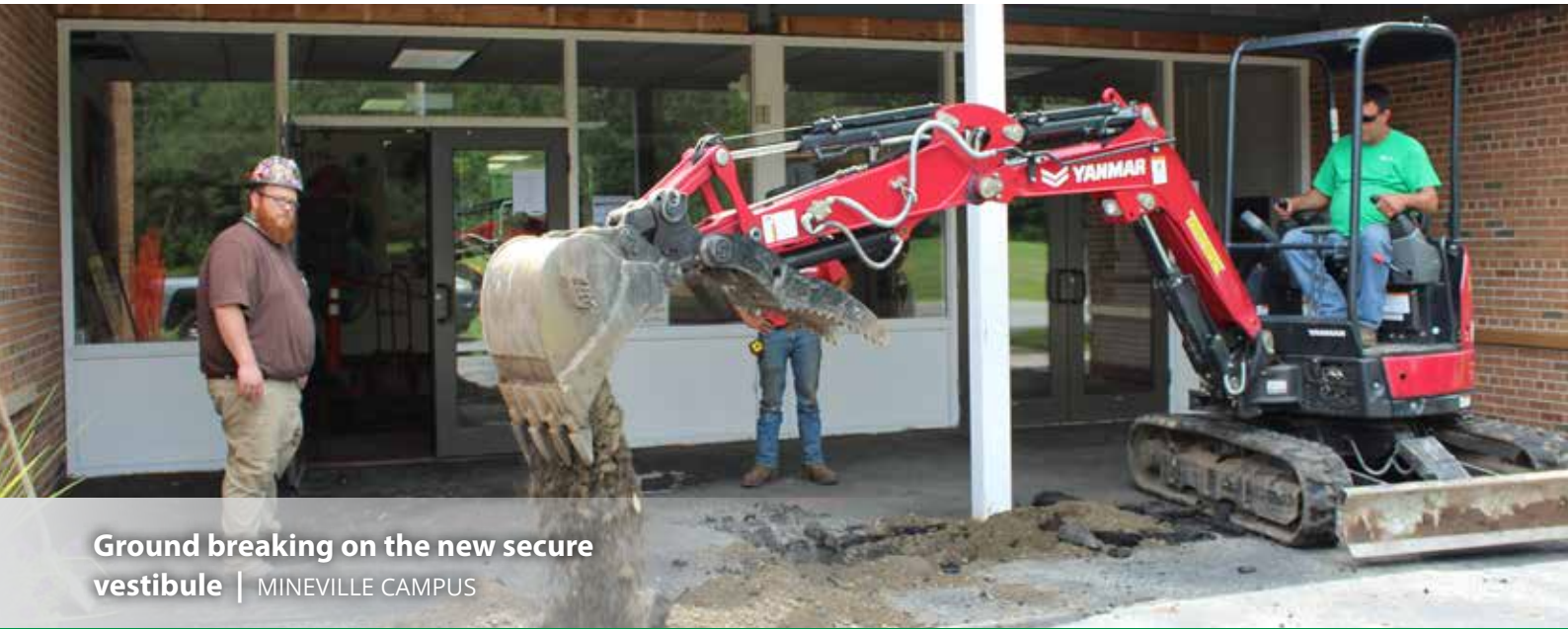
Ground breaking on the new secure vestibule | MINEVILLE CAMPUS

Champlain Valley Educational Services Capital Project Update - Issue #24 Thursday, July 29, 2021