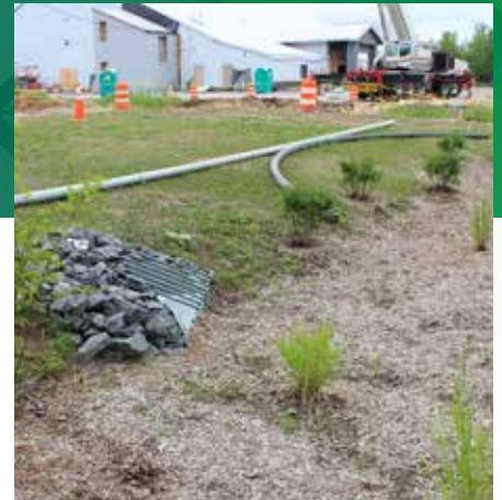
JULY 2021 - Site work