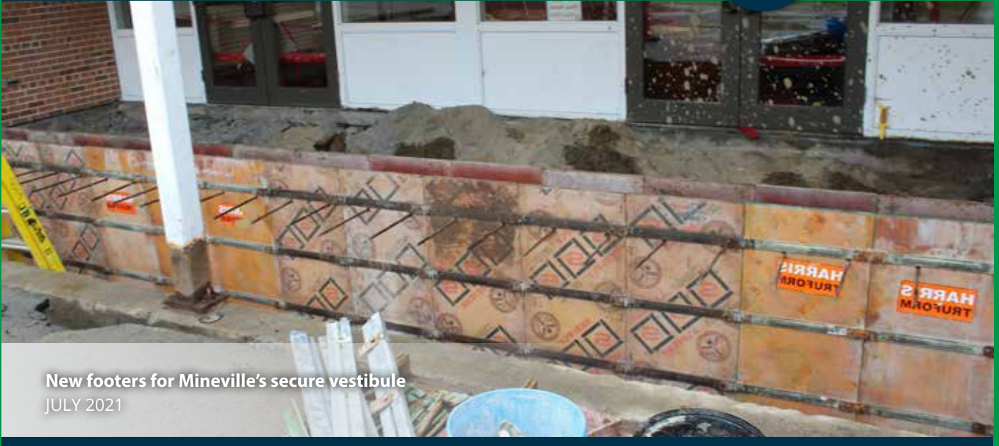
New footers for Mineville's secure vestibule JULY 2021