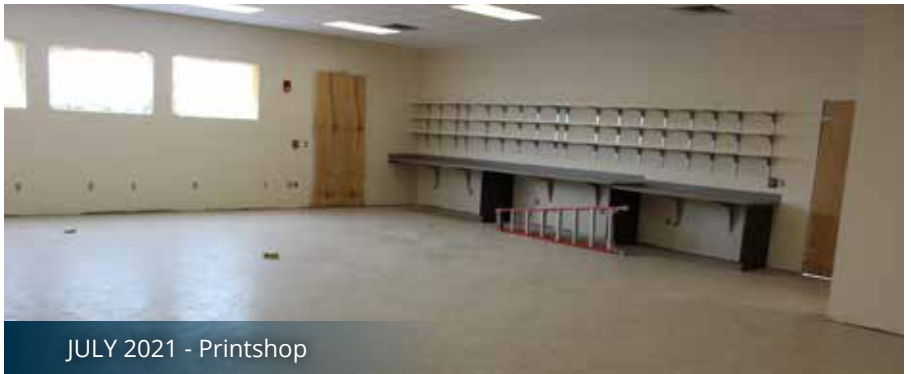
JULY 2021 - Printshop