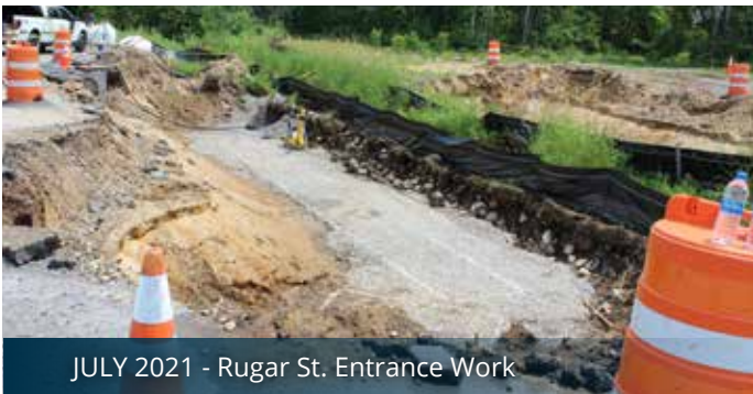
JULY 2021 - Rugar St. Entrance Work