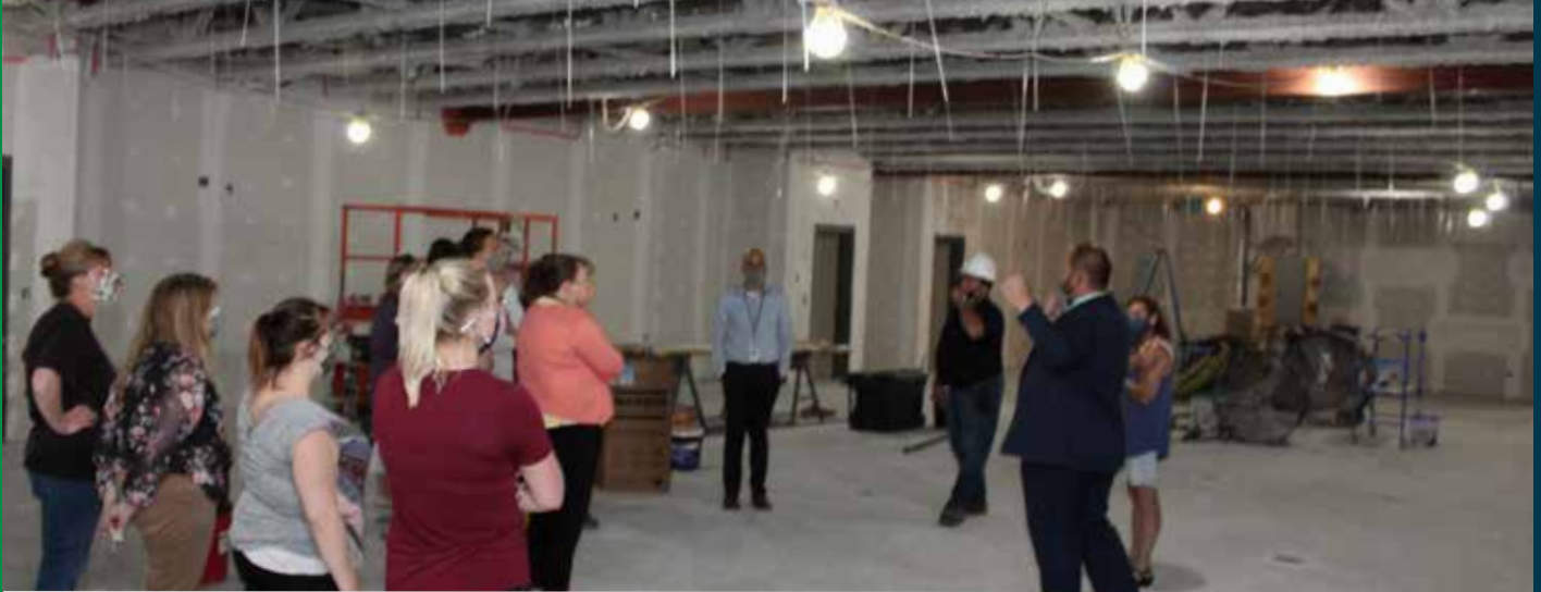
Tour of the Satellite South Building JUNE 2021