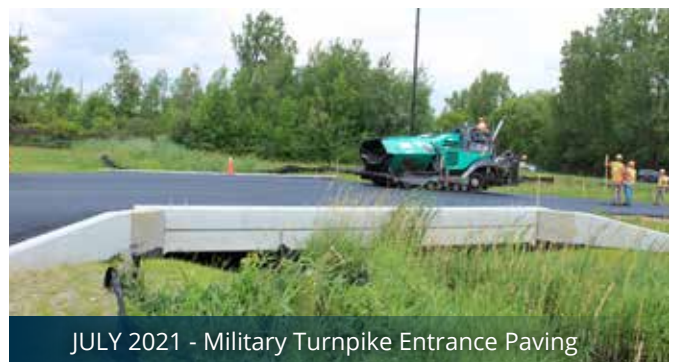
JULY 2021 - Military Turnpike Entrance Paving