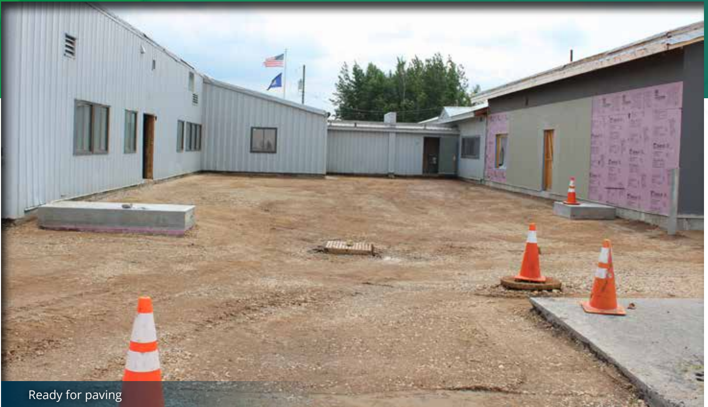
Ready for paving