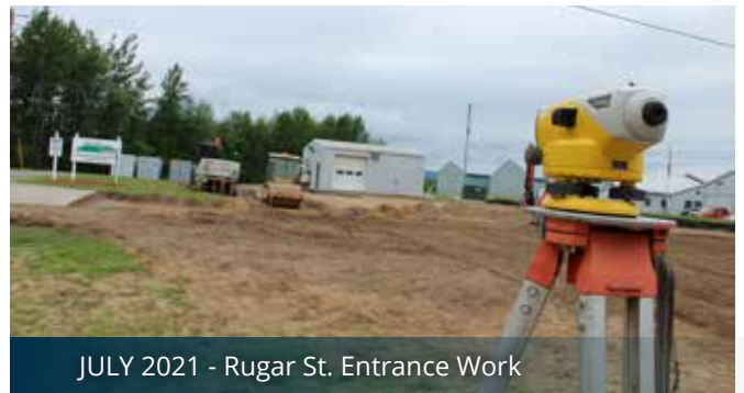
JULY 2021 - Rugar St. Entrance Work