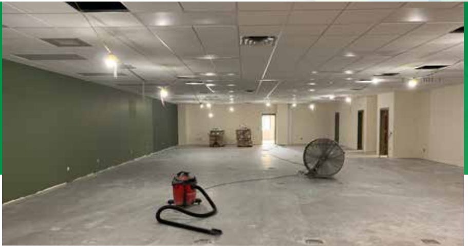
Conference Space JULY 2021