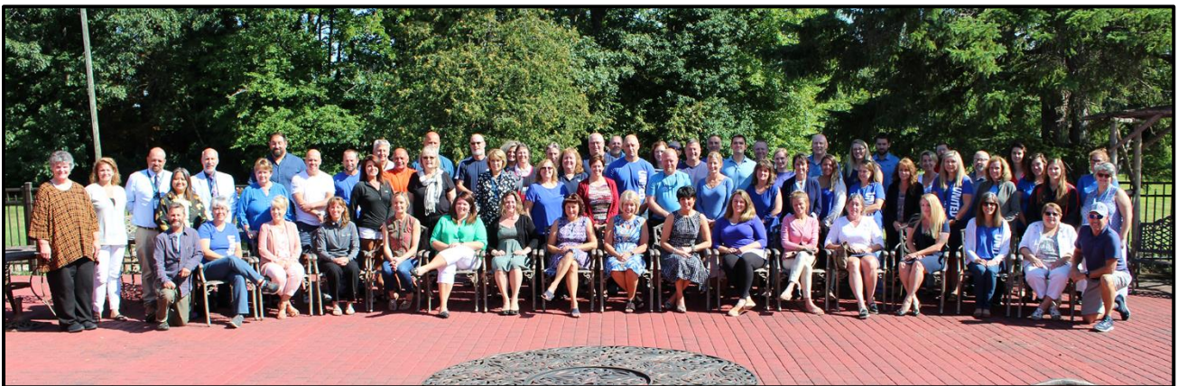
CV-TEC Faculty, Staff, and Administration 2019