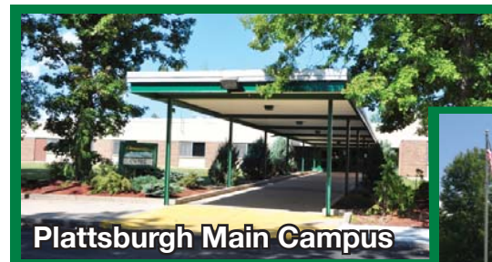
Plattsburgh Main Campus