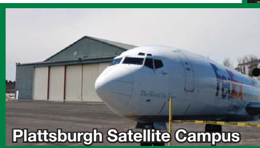
Plattsburgh Satellite Campus