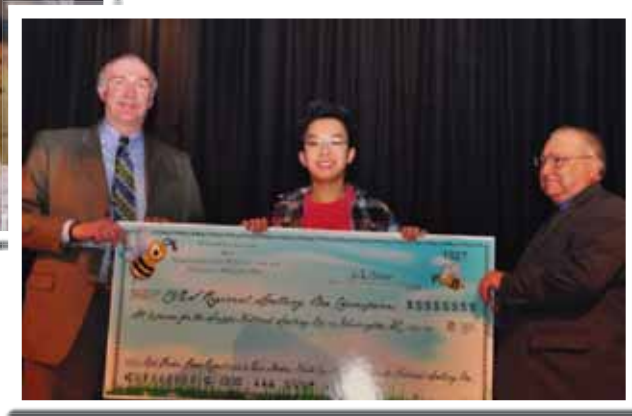
Above, Instructional Services 2010 Math Forum. Right, 2011 CVES Regional Spelling Bee.