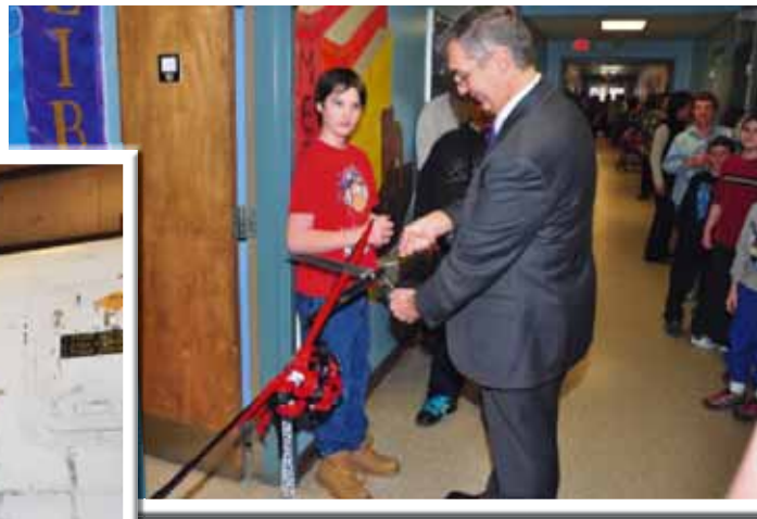
Left, Plattsburgh Aeronautical Institute. Above, ribbon cutting at WAF Special Education Library.