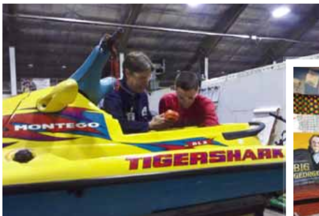
Above, CV-TEC Small Engine Repair classroom. Right, WAF Special Education Library Grand Opening.